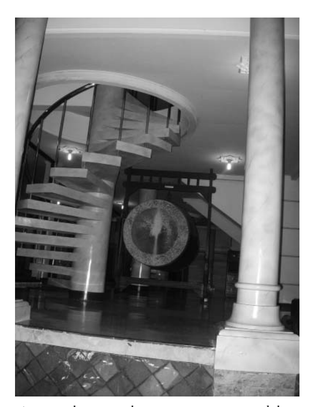
Figure 2: The UIN Malang Campus Mosque Beduk

to be seen. For example, Medan has very few pesantren in the surrounding area (five total) as compared to the thousands found near Malang and Yogya.